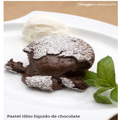
Pastel tibio líquido de chocolate